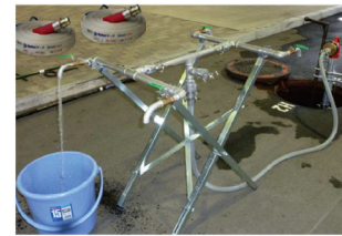
Fig. 3: Emergency water supply from a fire hydrant

Supplying water by local governments and residents using emergency water supply materials and equipment plus fire hydrants and drain valves located near evacuation centers.