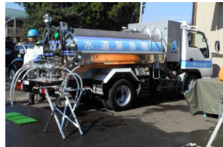
Fig. 2: Water supplied via water truck

Supplying water using water transported via water trucks and water supply tanks to evacuation centers located at least 2 km away from water supply points, medical facilities, and welfare facilities.