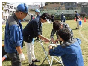
Fig. 6: Assembly training by residents