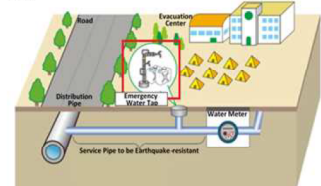
Fig. 7: Installation Image of an Emergency Water Tap in an Evacuation Center