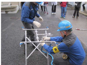
Fig. 5: Demonstration of assembly and operation by TMWB