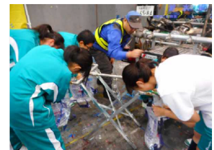
Fig. 8: Water supply training by high school students