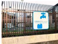
Fig. 4: Emergency water supply station sign

TMWB is responsible for emergency water supply station facility construction and mechanism creation, while local governments are primarily responsible for emergency water-supply activities at emergency water supply stations.