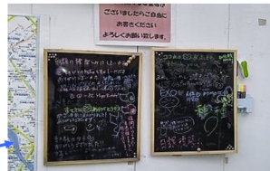
Figure 5-1: Build mutual communication by writing in responses to written opinions and comments.