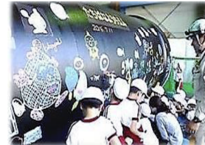
Figure 6: Primary school students painting a water pipe before its installation.