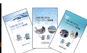
Figure 9: Booklets published every other year to showcase case studies that boost the public image of waterworks construction.