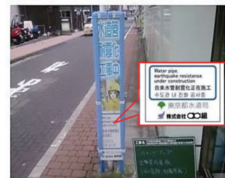
Figure 4: Installed construction signs decorated with an anime character and marked in four languages in the Akihabara area, which draws sightseers from inside Japan and around the world seeking anime-themed products.