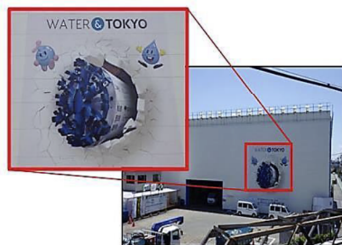
Figure 2: Displayed an actual-size shielding machine on a noise-suppression panel to convey a sense of the size of the construction work underway.