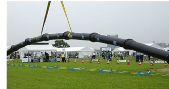
Figure 1: Responds to movements in the ground such that the joints do not come loose.

Just under half of the complaints received by the Waterworks Bureau pertain to construction. The understanding and cooperation of nearby residents is essential to the smooth execution of construction work, and how to obtain such understanding and cooperation is one of the tasks before us. For that reason, we will introduce some of the Waterworks Bureau's initiatives below.