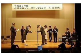
Figure 8: Awards ceremony for a competition.