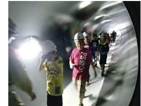
Figure 7: Primary school students walking through a water pipe.