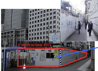
Figure 5: Install PR signage for waterworks along pedestrian walkways.