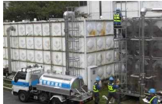
Fig. 7: Emergency drill for supplying water to an emergency hospital