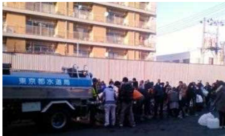
Fig. 4: Emergency water supply activities after the Great East Japan Earthquake

The primary objective of emergency disaster aid activities is obviously to provide relief for disaster victims. Personnel with experience performing such relief work in disaster-stricken areas learn actual crisis response skills through real experience that they could never acquire by training alone. That experience will be put to use in the event that there is ever a disaster in Tokyo.