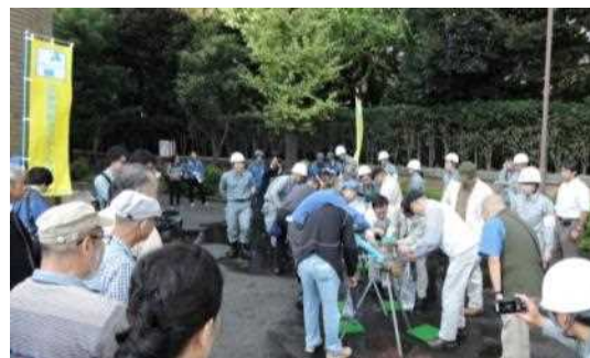
Fig. 3: Emergency water supply activities at a water station, a collaboration of local residents, city office personnel, etc.