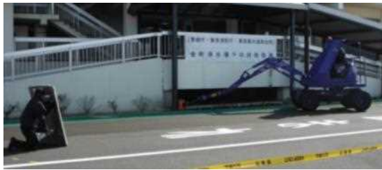
Fig. 8: Drill on Handling Bomb-related Terrorism

In anti-terrorism measures, one assigned staff member provides just two eyes, but 100 personnel and local residents total 200 eyes' worth of surveillance. Personnel and local residents thus work together to use the "Community's Eyes" to protect the Waterworks Bureau from terrorism.