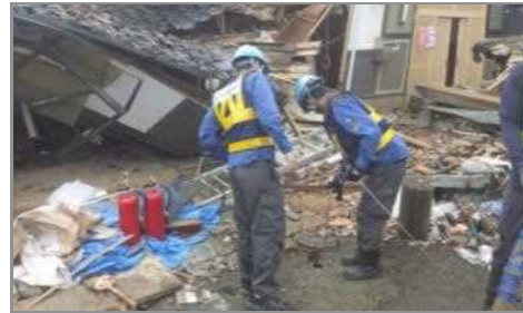
Fig. 5: Emergency restoration activities after the Kumamoto earthquakes