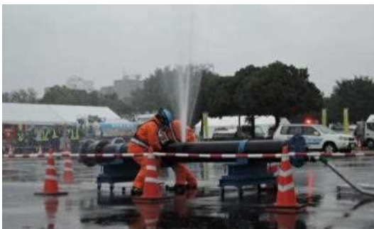
Fig. 2: Emergency restoration of water pipes