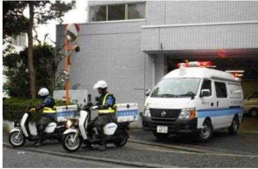
Fig. 6: Securing a supply route to central capital agencies