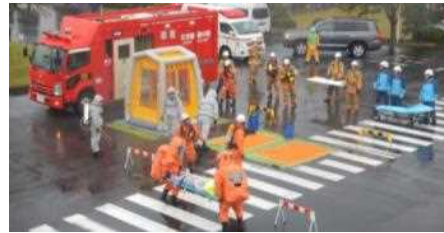
Fig. 9: Drill on Handling Poison-related Terrorism at Higashimurayama Water Purification Plant