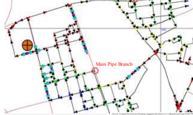
Water pressure to important facilities 0.14[Mpa]

Results of pipe network analysis when the "supply route" has not been retrofitted with earthquake-resistant joint pipes