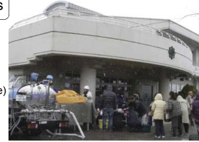
Emergency water supply at evacuation sites

Transmission pipes knocked loose by the Great East Japan Earthquake (Diameters: 2,400 mm) (Miyagi Prefecture)